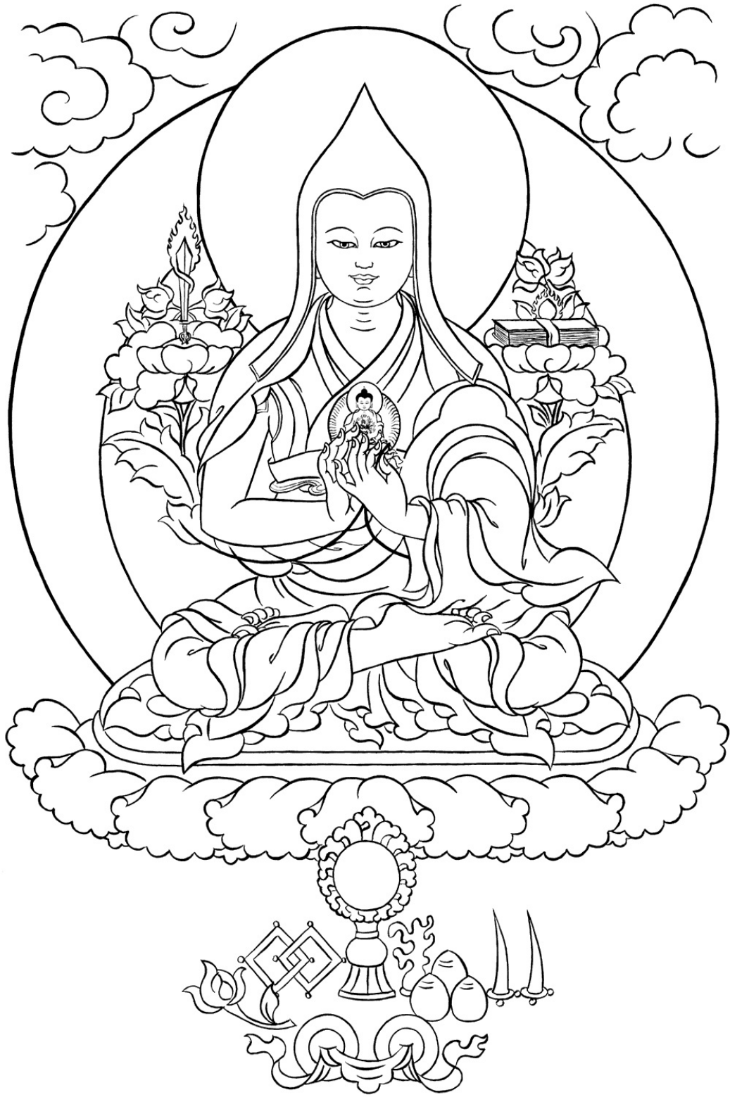
Guru Sumati Buddha Heruka